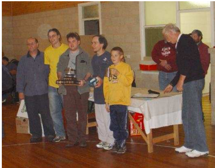
The VK3YDF team – being presented with the cup as overall winners.

Proving that all those supercomputers do help, achieving 1 st , 2 nd , and 3 rd places in the various categories.