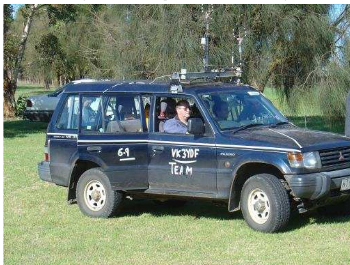
The Overall Winner - the VK3YDF team, set up for a HF hunt.

Proving that all those supercomputers do help, achieving 1 st , 2 nd , and 3 rd places in the various categories.