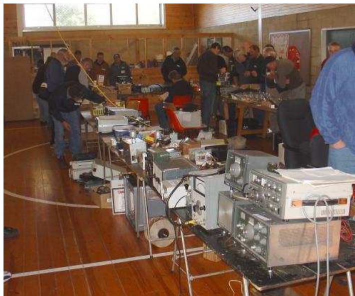
A good assortment of new and pre-loved items at the hamfest. A handy source of spare parts when you wipe out an antenna on a pine tree during the hunts.