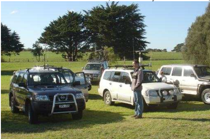
Lining up for the start of a hunt.