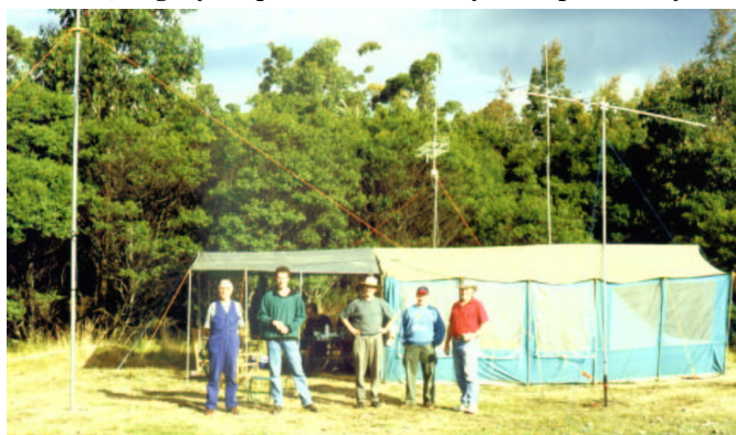
The VHF tent at the 2000 field day

PS: Residents of Banyule (and others?) need to vote on Saturday 15 th March, so get your postal votes in early to keep Saturday clear.