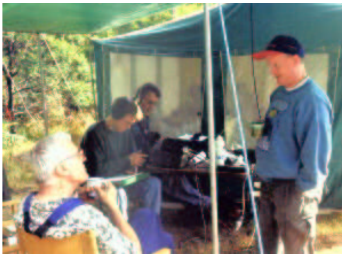
The boys playing radio at the VK3CNE 2000 field day

For a full copy of the rules see http://www.nerg.asn.au/JMrules03.pdf