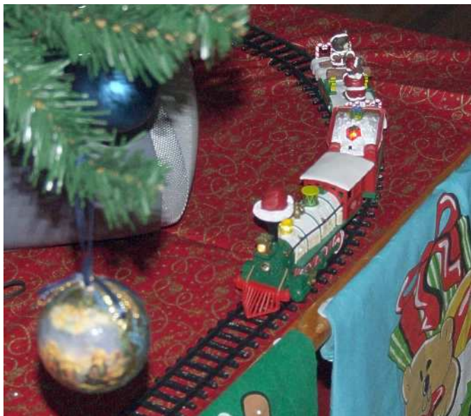
The Christmas Tree and Train Set are a big hit with the kids.

Over thirty members and friends met on the Saturday night for a traditional Christmas Dinner.