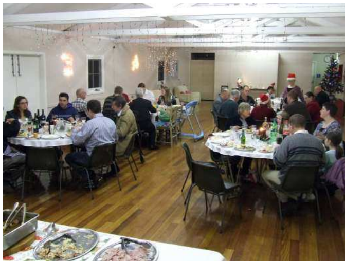
As can be seen from the photos much conversation was had and everyone agreed it was a great time.

A full Christmas dinner with turkey, lamb, ham, roast spuds and pumpkin as well as beans, peas, cauliflower cheese was enjoyed by all. This was followed by a traditional Christmas pudding, brandy sauce, ice cream and fruit salad.