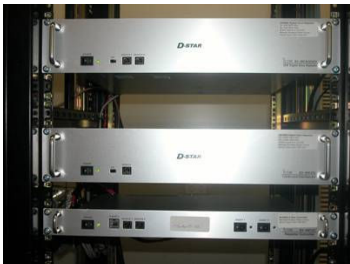
The new ICOM D-Star repeaters at VK3RBA.

New repeaters have been installed by BARG with ICOM and WICENs assistance at Ballarat's Mt Buninyong tower under the callsign VK3RBA. There is a conventional FM voice repeater and a D-star voice/data repeater, both on 70cm, and a D-star high speed data-only repeater on 23cm.