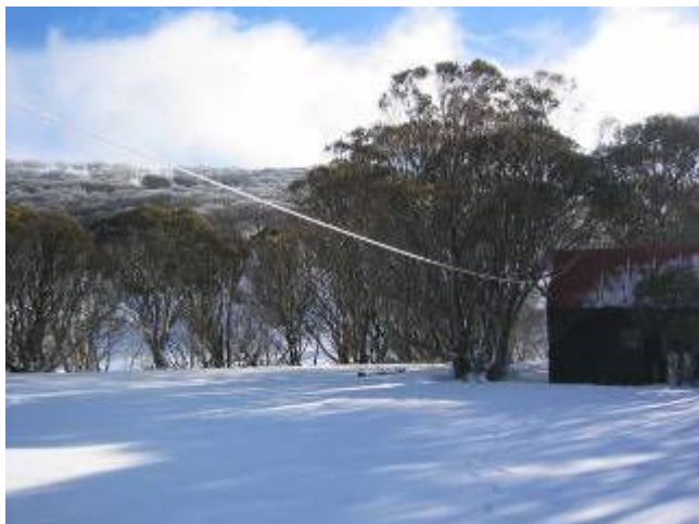
A frozen longwire antenna runs back to the hut

With portable solar cells and gel-cells they were able to operate a tiny HF transceiver into simple wire antennas, making QRP contacts on 80, 40 & 20 metres. UHF/VHF handhelds were also used to keep the group in touch with each other during the ski-pedition. Attempts were made to build an Igloo though the hut was far warmer! Steve and the gang have offered to show more of the fabulous photos at a forthcoming NERG meeting so stay tuned for more great shots.