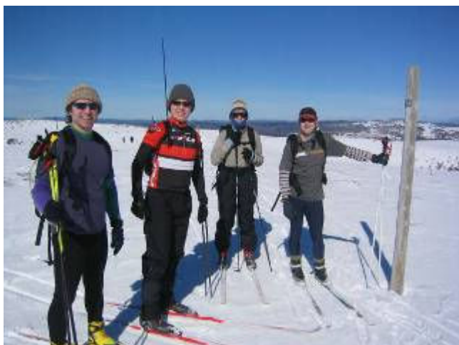
Part of the team braving the elements (apparently this was before the whiteout!)